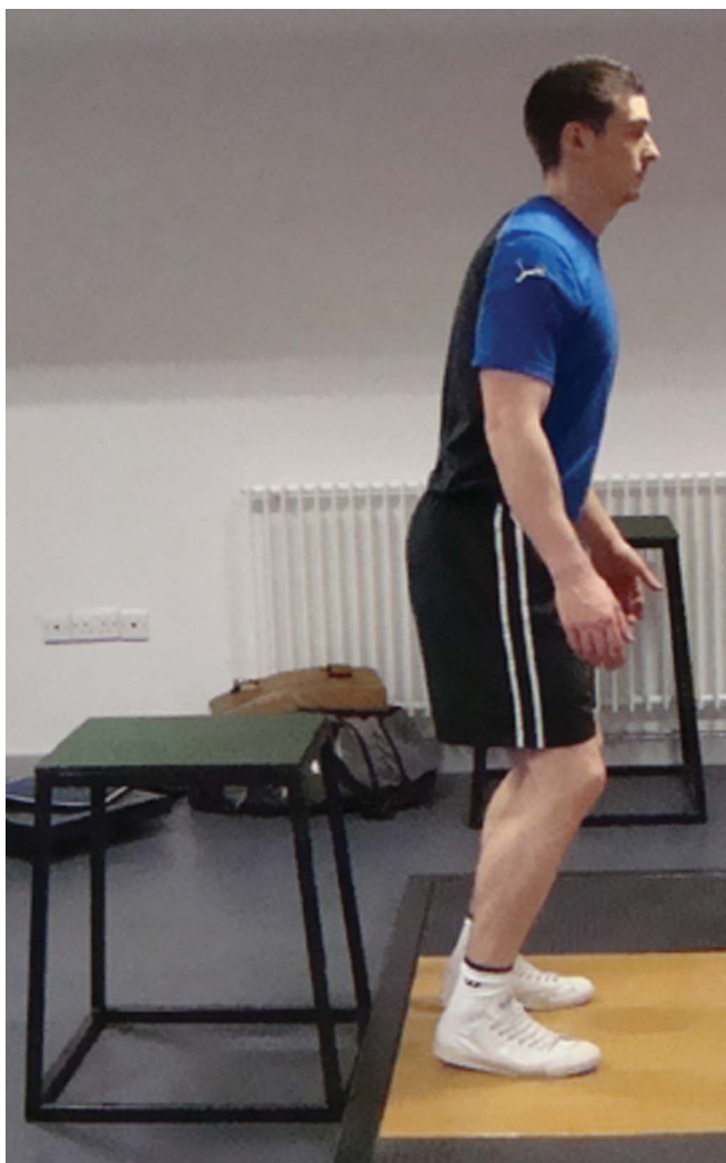
Figure 12. Drop land.

incidence of these injuries through its positive adaptations on the structural integrity of all involved joints. For example, as well as an increase in muscle strength, tendon, ligament, and cartilage strength would also increase along with bone mineral density (35,37,92). Furthermore, boxers tend to use (and therefore develop) the anterior musculature more than the posterior (2), thereby leaving them exposed to muscle strains in the weaker muscles. S&C training can ensure the development and maintenance of proper ratios. Most significantly and pertinent to performance, increasing antagonist muscle strength may increase movement speed and accuracy