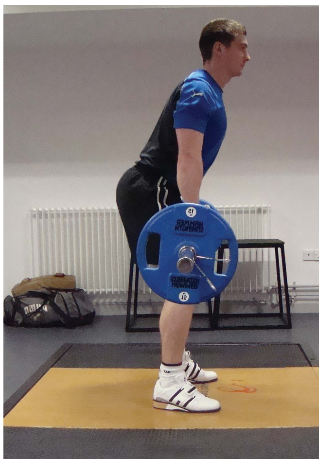
Figure 8. Second pull position.