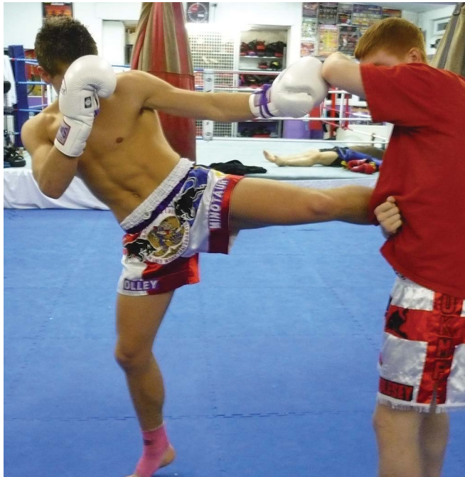
Figure 6. Roundhouse kick.