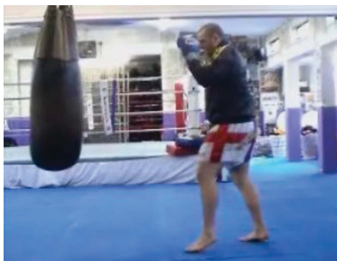
Figure 9. Front leg knee starting position.

negative correlation to performance. This is further corroborated by authors who suggest that once an aerobic base is achieved, sport-specific team practices and games are sufficient to maintain aerobic fitness in anaerobic-dominant sports (17,56,57). Training programs therefore need to be directed toward high-intensity training such as interval and repetition training. Many athletes, however, use long distance running as a means to rapid weight loss (RWL). This, however, may be to the detriment of sports performance and perhaps more emphasis needs to be placed on nutritional interventions (but those based on scientific research). RWL is briefly discussed later in this text.