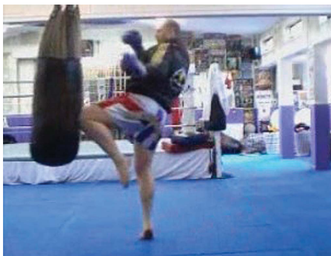
Figure 11. Front leg knee strike.

stores (19,94), reduced lean muscle mass (66), and negative mood (48,66,91). Significant to the latter factor, mood has been shown to be an effective predictor of performance in combat sport with 92% of winning and losing performances in karate correctly classified from precompetition mood (95). Losing karate performance was associated with high scores of confusion, depression, fatigue, and tension coupled with low vigor scores (95). There appears an evident paradox,