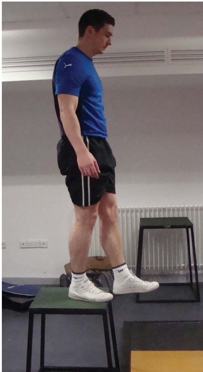
Figure 13. Step from box (before drop land or drop jump).

ethos of quality over quantity should be enforced.