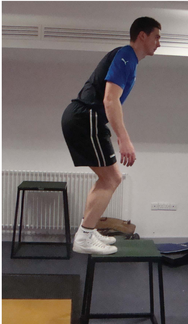
Figure 14. Jump up to box.

required for these athletes and more objective data are required within the sport of Muay Thai.