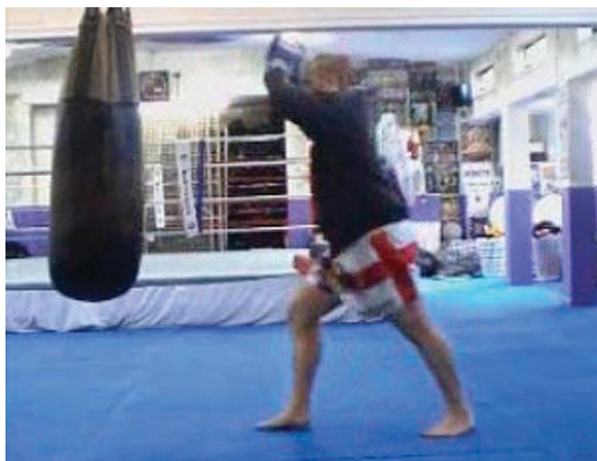
Figure 10. Front leg knee—the athlete switches stance.

for delivering this aspect of training; however, it is important to note that these are suggestions that can be made to the sports coach.