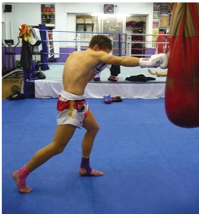
Figure 1. Straight.

shoulder to the leg musculature. This investigation revealed that for beginners, the correlation between athletic achievements and strength of the arm