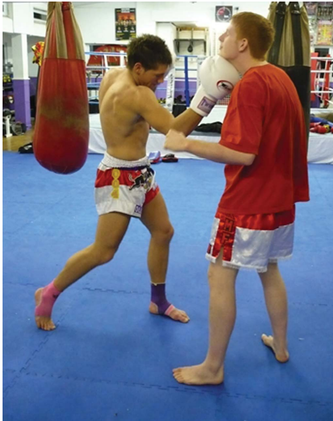
Figure 3. Uppercut.

capabilities of an athlete, may also be considered fundamental to force generation within Muay Thai. It is well documented that efficient SSC mechanics result in enhanced propulsive forces (11,14,15) and conservation of energy (12,100,102), and this therefore suggests that within martial arts, this may translate into enhanced power and power endurance of striking. As an example, double kicks or consecutive knees to an opponent require that after