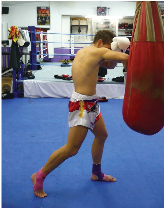
Figure 4. Elbow.