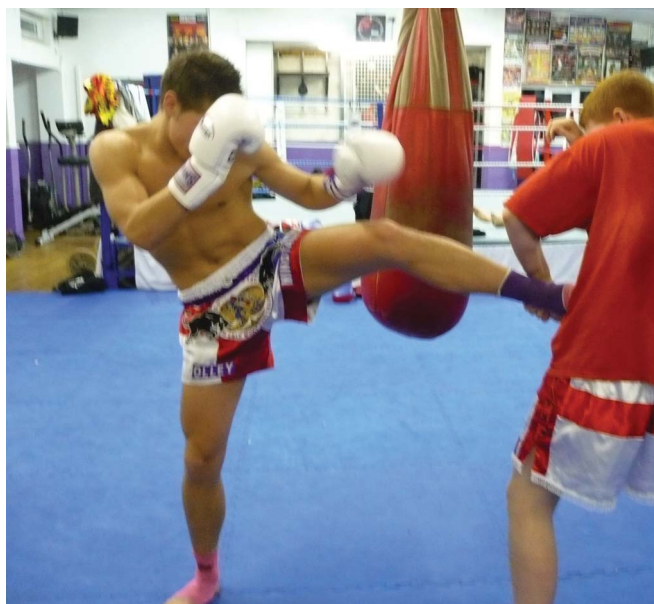
Figure 5. Push kick.

(72,75,78,82,85,88,90). For example, Kyrolainen et al. (72) reported that 4 months of plyometric training, consisting of various jumping exercises such as drop jumps, hurdle jumps, and hopping, was required for the disinhibition of the GTO and the generation of muscle stiffness (concurrent with pre-activation tensioning and antagonistic cocontraction). Moreover, as well as takeoff velocity increasing by 8%, energy expenditure decreased by 24% suggesting that adaptations from this plyometrics protocol also resulted in a reduction in the metabolic cost of these movements (72). It appears apparent therefore that chronic plyometrics training is required to not only condition the Muay Thai athlete to increase striking forces of this nature but also facilitate them in employing these strikes with regularity (aid the development of power endurance). Finally, inherent to plyometric exercises is the powerful execution of triple extension (as previously described), so these exercises are also likely to have a carryover to kicking and punching mechanics and striking power.