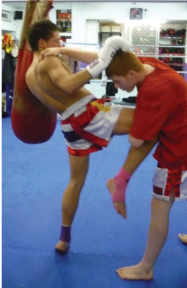
Figure 7. Knee.